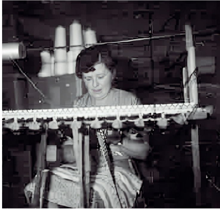
bmfabrics: quality & tradition since 1949